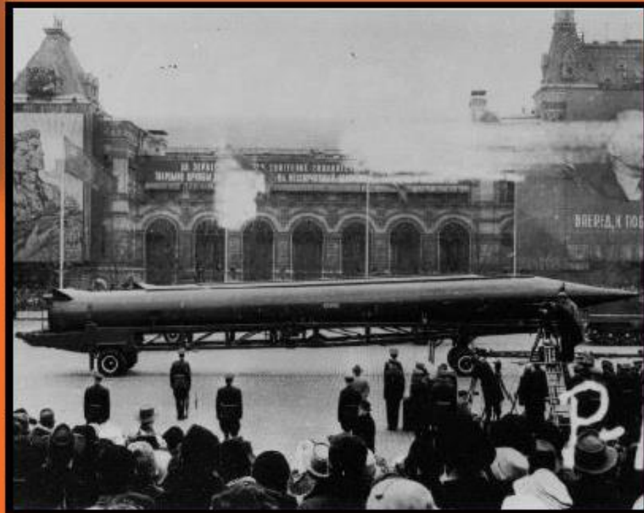
Soviet Ballistic Missile